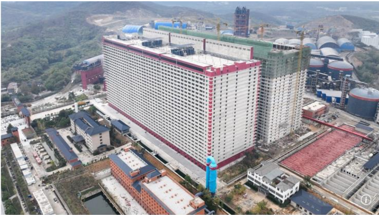
The SOB Act contains no restrictions on foreign ownership, effectively clearing the path for China’s high-rise mega-farm model — 25-story factory skyscrapers housing over 1 million pigs — to come to America.